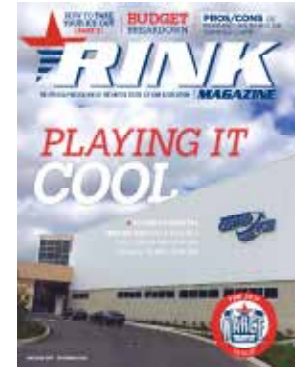
The official publication of the United States Ice Rink Association